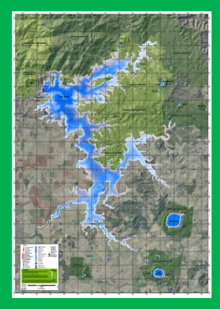
Figure Two: 'Thumbnail' image of Lake Tinaroo map

The community was also engaged to provide lots of information for the map and it's reverse side, such as fishing hotspots, recreational activities, points of interest and facilities in the area that can be used by the visiting public.